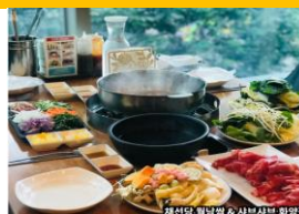
Korean style shabu-shabu Sliced meats, vegetables, seafood, mushrooms, tofu, etc. are lightly poached in a boiling broth and served with a marinade. The vegetables are all-you-can-eat