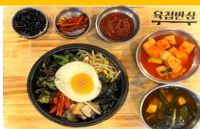
Stone Pot Bibimbap (rice with herbs and vegetables) *Option without egg