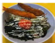
A bowl of rice topping Fried Shrimp and Roe