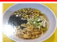
Udon (noodles) * meatless