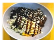
Bibimbap (rice with beef or pork)