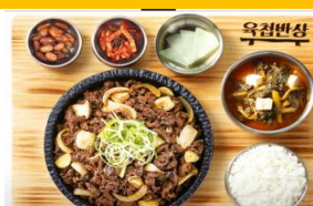
Bulgogi with mushrooms