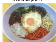
Bibimbap (rice with vegetables) *Option without egg