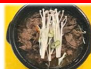
Bulgogi (Beef hot pot)