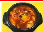
Tofu stew(spicy) * meatless