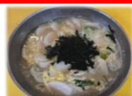
Dumpling soup with Rice cake